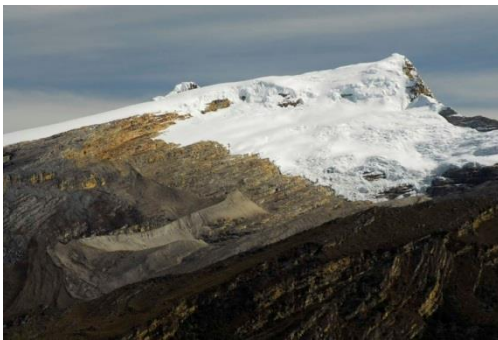
The Ritacuba Negro glacier in the Colombian Andes, where rock samples were collected as part of this study.